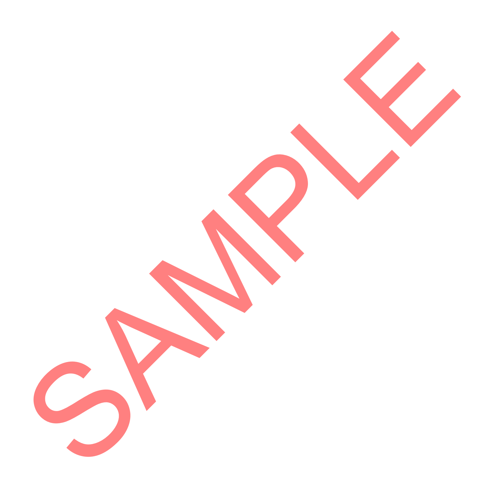
PART 8. ENDORSEMENTS - Required endorsements are attached to the back of this page.