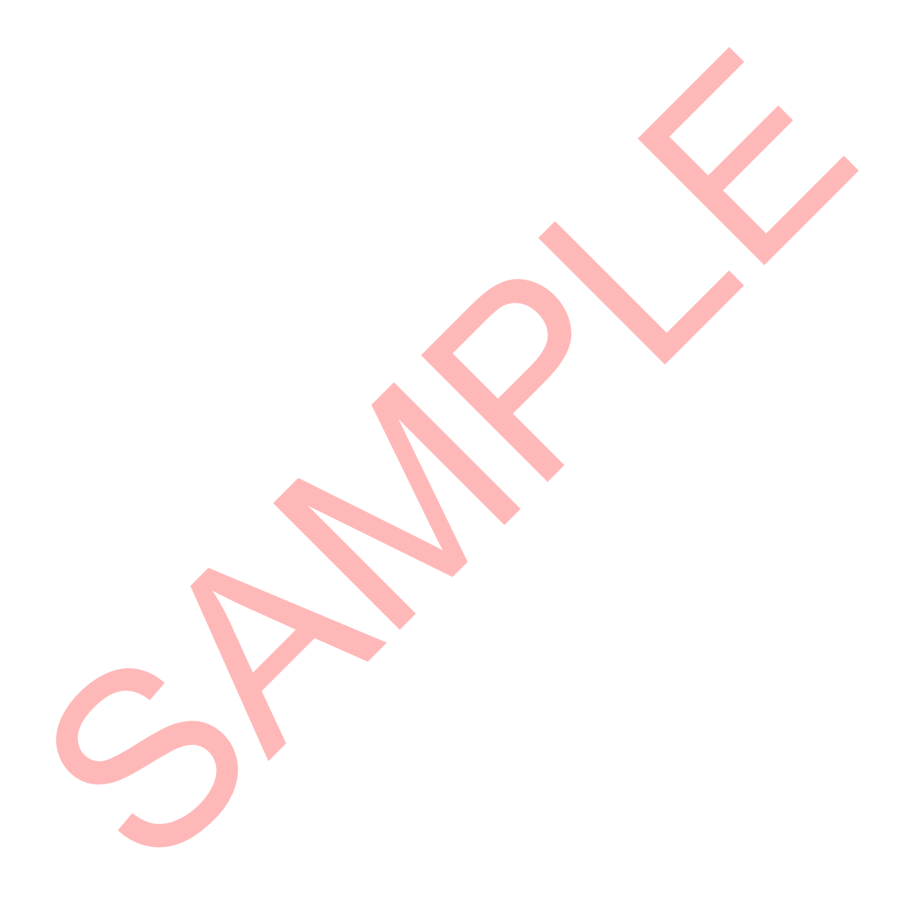
PART 8. ENDORSEMENTS - Required endorsements are attached to the back of this page.